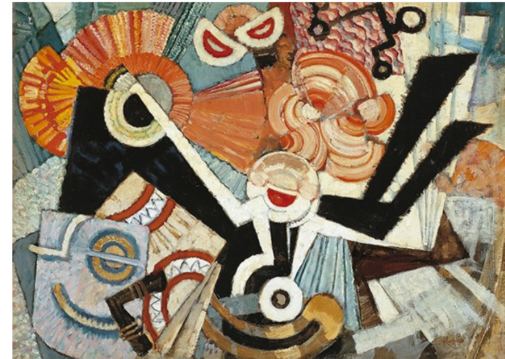
František Kupka: Syncopated Accompaniment