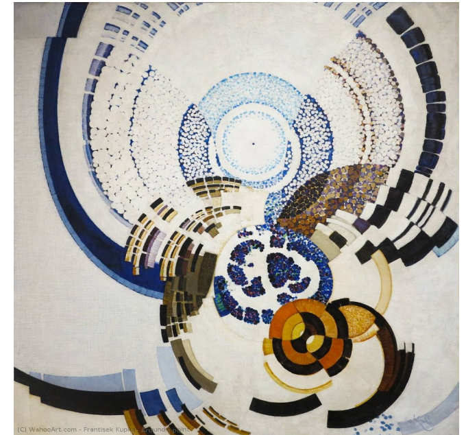
František Kupka: Around a point