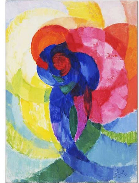
František Kupka: Red and Blue Disks